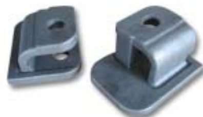
investment steel casting-03