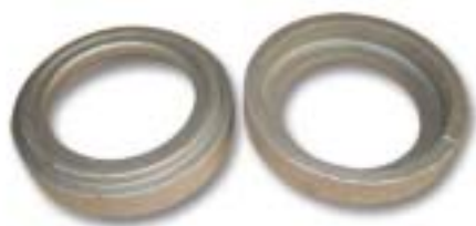
Industrial Investment Castings-02