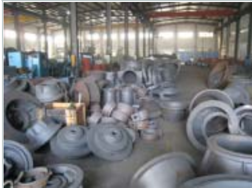
Industrial Investment Castings-01

Steel castings , casting china steel , casting manufacturer steel , Duplex Steel Castings , Fully Machined Steel Castings , High Alloy Steel Castings , Low Alloy Steel Castings , industry steel casting , Steel investment casting , stainless steel investment castings , investment steel casting , Carbon Steel Castings , Carbon Steel Investment Castings , Construction parts , Excavator teeth , bucket teeth , Excavators Tooth , Bucket Tooth , bucket teeth , Engineering Steel Castings , Engineering Investment Castings , Automotive Steel Castings , Automotive Investment Castings , Steel Marine Castings , Cast of the marine , Industrial Investment Castings , Valve Investment Castings , Large steel casting , Small steel casting , Pacific Steel Castings , Cast iron steel , Steel casting process , Continuous steel casting , Continuous Casting of Steel , Casting Machining , Casting process , Casting metal , Cnc machined parts , Precision machined parts , Steel Casting Machining , Machinery parts casting , Investment Casting Tooling , Production Investment Casting Tooling ,