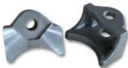
investment steel casting-04