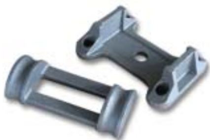
investment steel casting-05

Steel castings are utilized by multiple industries including energy, construction, transportation, general industry, and marine. Because steel are stronger than cast iron, wrought iron, and malleable iron, steel castings are typically used in the manufacturing of parts that must endure shocks, wear, or heavy loads. Steel castings can be made from carbon steel, low and high alloy steel, low temperature steel, heat resistant steel, and stainless steel.