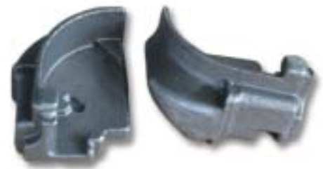
Steel Marine Castings-07