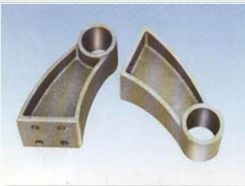
castings of bridge frame