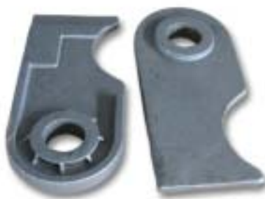
Steel Marine Castings-08