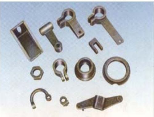
large-scale mixer parts