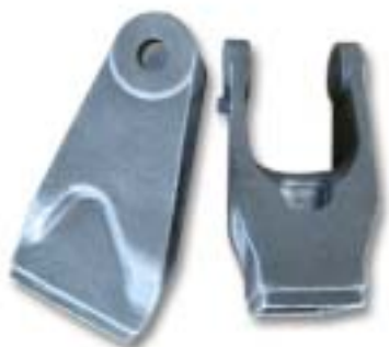
Carbon Steel Investment Castings05