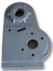
Steel Marine Castings-09