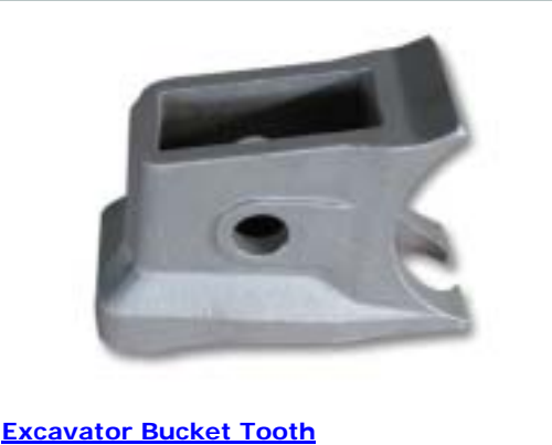
Excavator Bucket Tooth