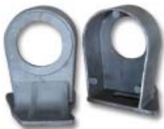
Carbon Steel Investment Castings04