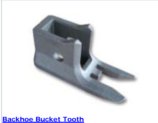
Backhoe Bucket Tooth