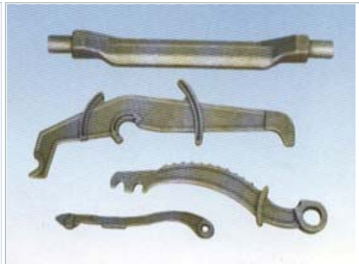
accessories of textile mechanic