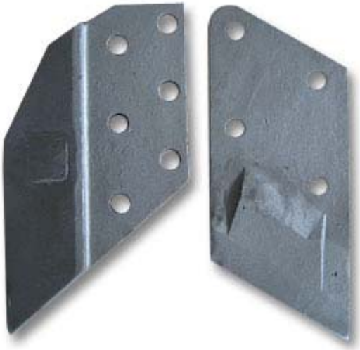
Side cutters cutting edges

Steel castings , casting china steel , casting manufacturer steel , Duplex Steel Castings , Fully Machined Steel Castings , High Alloy Steel Castings , Low Alloy Steel Castings , industry steel casting , Steel investment casting , stainless steel investment castings , investment steel casting , Carbon Steel Castings , Carbon Steel Investment Castings , Construction parts , Excavator teeth , bucket teeth , Excavators Tooth , Bucket Tooth , bucket teeth , Engineering Steel Castings , Engineering Investment Castings , Automotive Steel Castings , Automotive Investment Castings , Steel Marine Castings , Cast of the marine , Industrial Investment Castings , Valve Investment Castings , Large steel casting , Small steel casting , Pacific Steel Castings , Cast iron steel , Steel casting process , Continuous steel casting , Continuous Casting of Steel , Casting Machining , Casting process , Casting metal , Cnc machined parts , Precision machined parts , Steel Casting Machining , Machinery parts casting , Investment Casting Tooling , Production Investment Casting Tooling ,