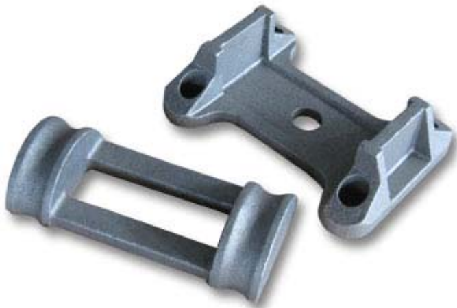
Engineering Steel Castings-11