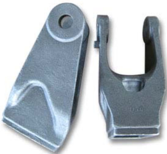
Engineering Steel Castings-17