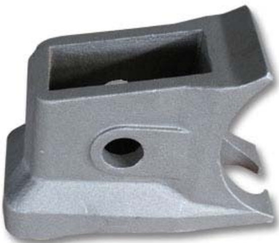
Engineering Steel Castings-12