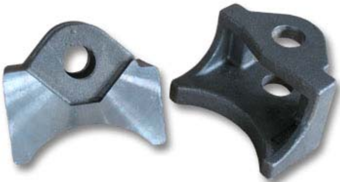
Engineering Steel Castings-07