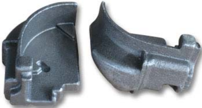
Engineering Steel Castings-08