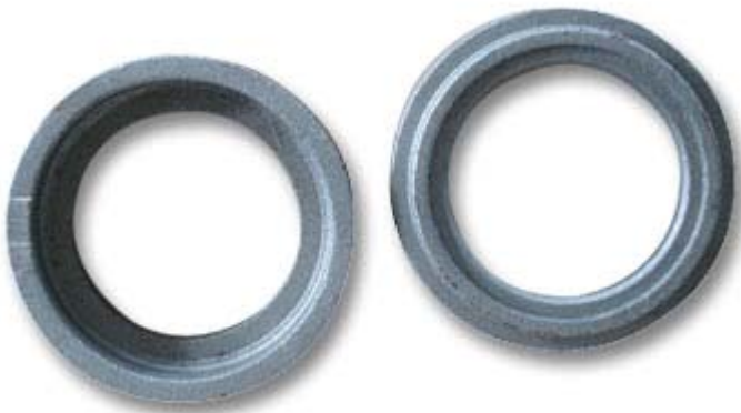
Engineering Steel Castings-02