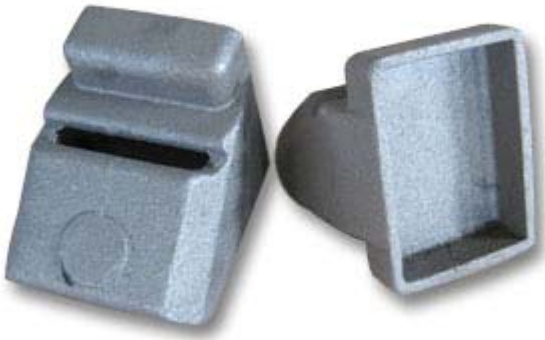
Engineering Steel Castings-04