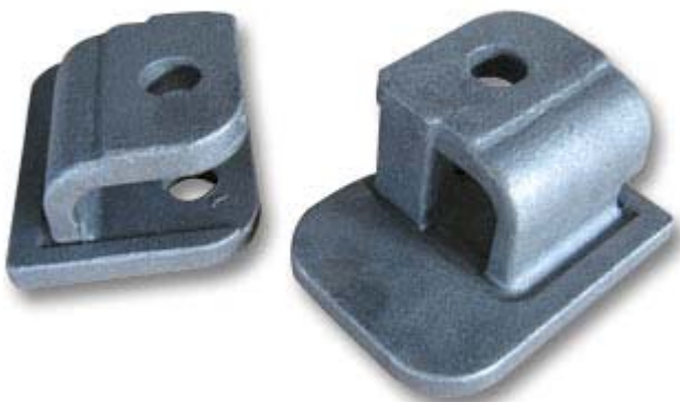
Engineering Steel Castings-06