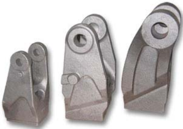
Engineering Steel Castings-19