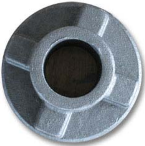
Engineering Steel Castings-14