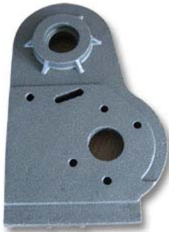
Engineering Steel Castings-10