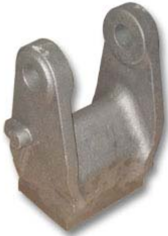
Engineering Steel Castings-18