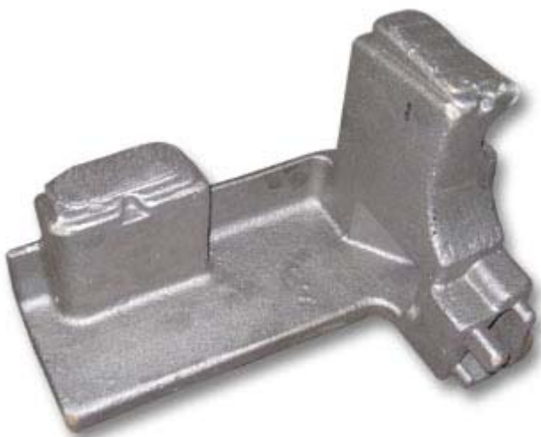
Engineering Steel Castings-20