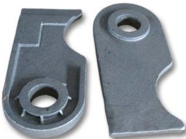
Engineering Steel Castings-09