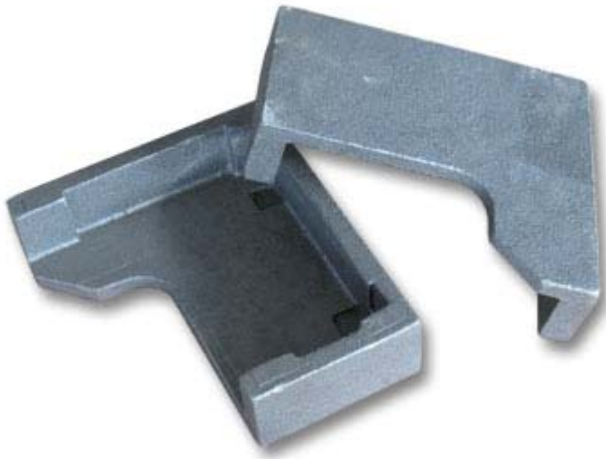
Engineering Steel Castings-15