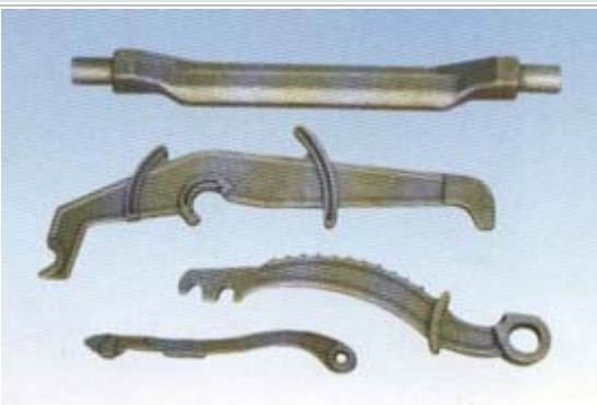
accessories of textile mechanic