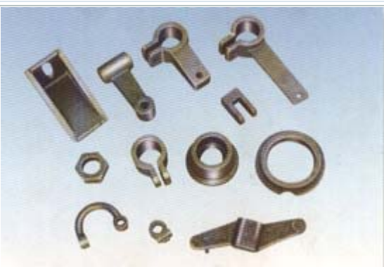
Large-scale mixer parts

We professional production : Investment Casting, Lost Wax Investment Casting , Metal Casting , Stainless Steel Investment Casting , casting parts, casting china steel , casting manufacturer steel , Duplex Steel Castings , Fully Machined Steel Castings , High Alloy Steel Castings , Low Alloy Steel Castings , industry steel casting, large steel casting, small steel casting, Excavator teeth, Construction parts.