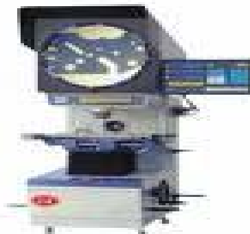
Precision Casting-Steel Casting