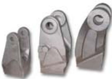
Steel Casting Machining-07