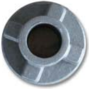
Investment Casting Tooling-03