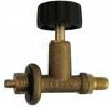
investment casting machining

Steel castings , casting china steel , casting manufacturer steel , Duplex Steel Castings , Fully Machined Steel Castings , High Alloy Steel Castings , Low Alloy Steel Castings , industry steel casting , Steel investment casting , stainless steel investment castings , investment steel casting , Carbon Steel Castings , Carbon Steel Investment Castings , Construction parts , Excavator teeth , bucket teeth , Excavators Tooth , Bucket Tooth , bucket teeth , Engineering Steel Castings , Engineering Investment Castings , Automotive Steel Castings , Automotive Investment Castings , Steel Marine Castings , Cast of the marine , Industrial Investment Castings , Valve Investment Castings , Large steel casting , Small steel casting , Pacific Steel Castings , Cast iron steel , Steel casting process , Continuous steel casting , Continuous Casting of Steel , Casting Machining , Casting process , Casting metal , Cnc machined parts , Precision machined parts , Steel Casting Machining , Machinery parts casting , Investment Casting Tooling , Production Investment Casting Tooling ,