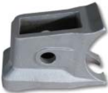
Cnc machined part

Machining ,metal machine ,heavy metal machine